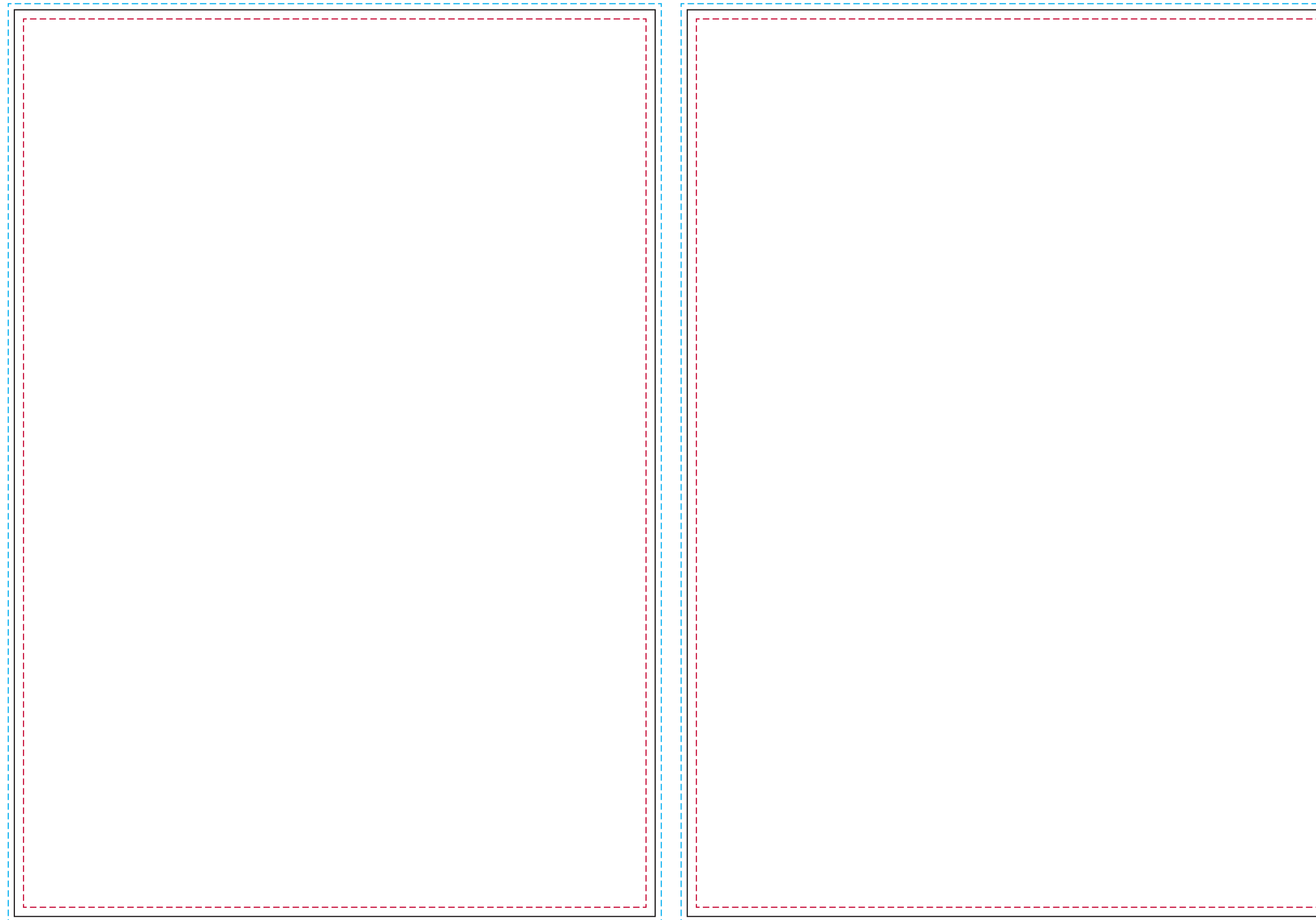
Each Sheet Front