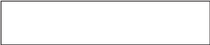
Back (extra charge)