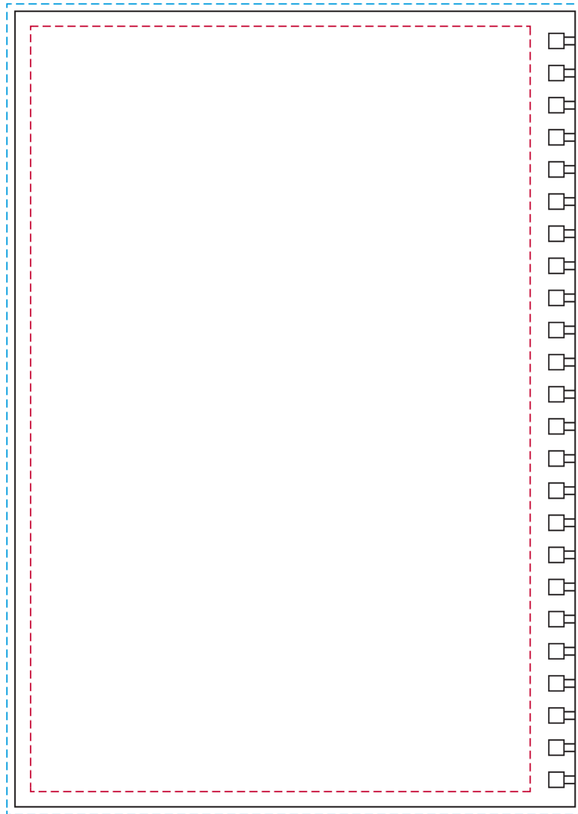
Each Sheet Front