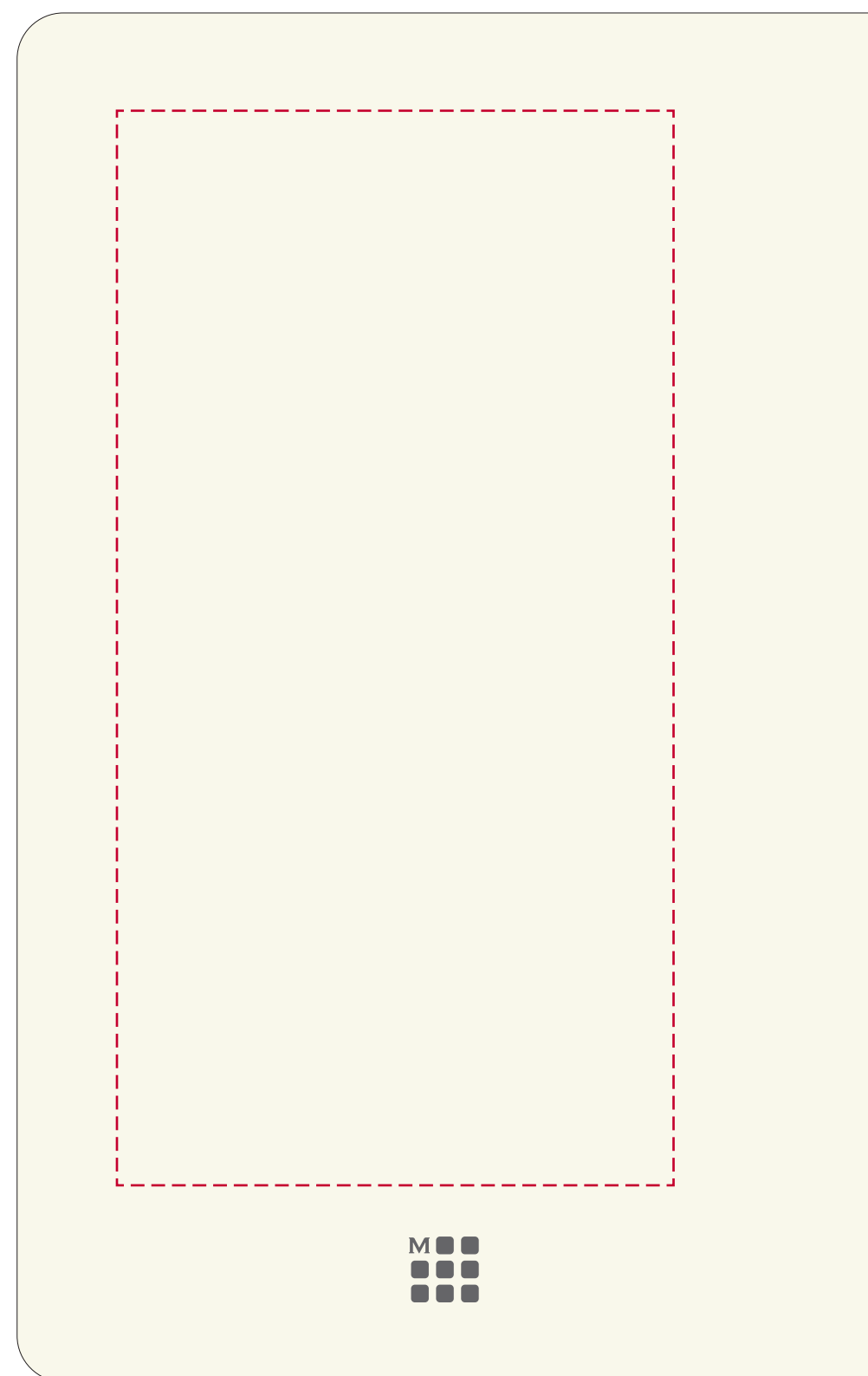
Inside Front Cover

Order Reference xxxxxx Date created xx/xx/xx Created by xx